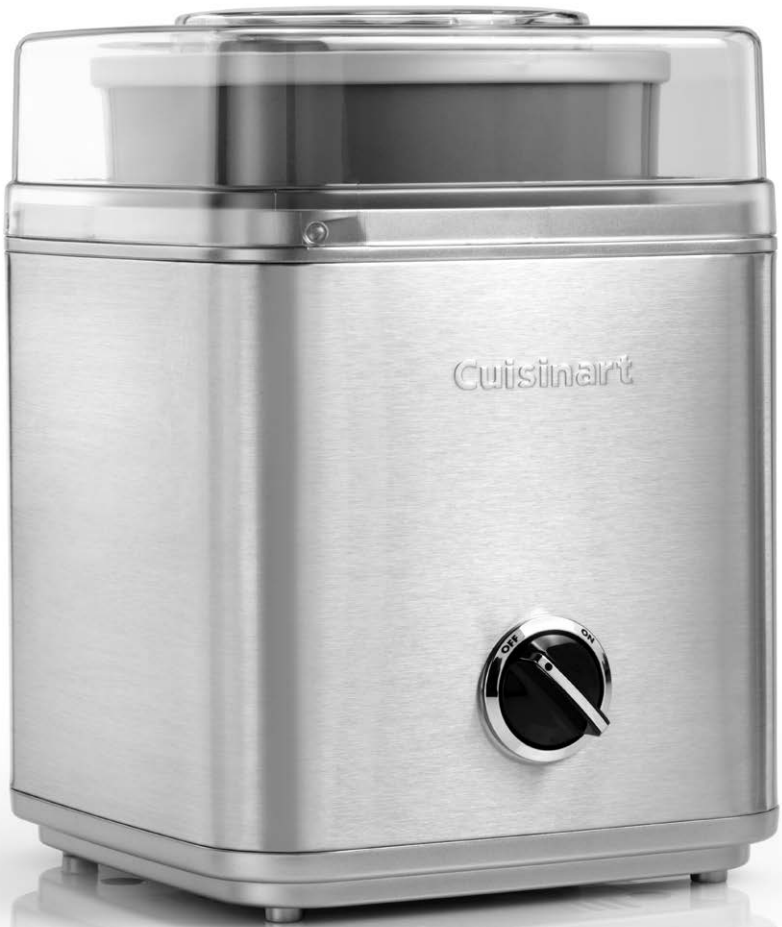
Ice Cream Maker ICE30BCU