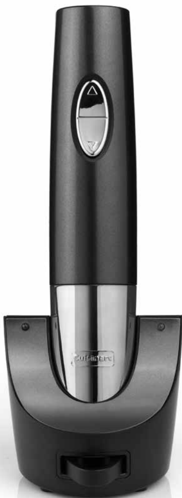
Wine Opener CW050U