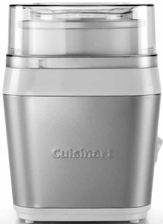
Iced Dessert Maker ICE31U