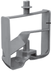
Ice Cream Paddle