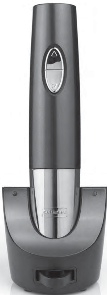
Wine Opener CW050U