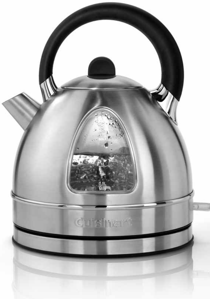
Traditional Kettle CTK17 Series