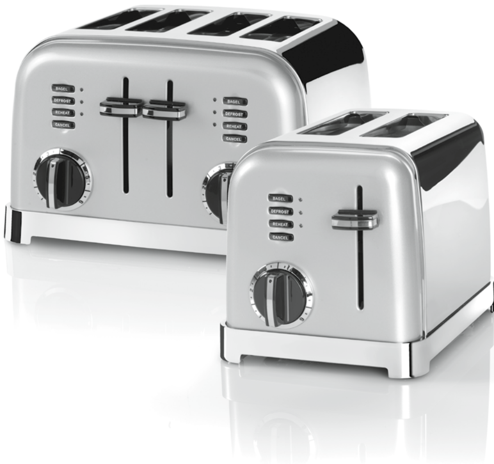
CPT160 & CPT180 Series Toasters